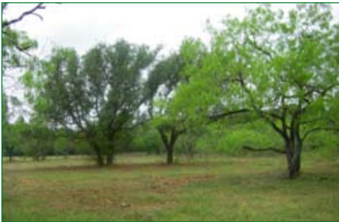
2 - Brush and small tree removal facilitates savannah.