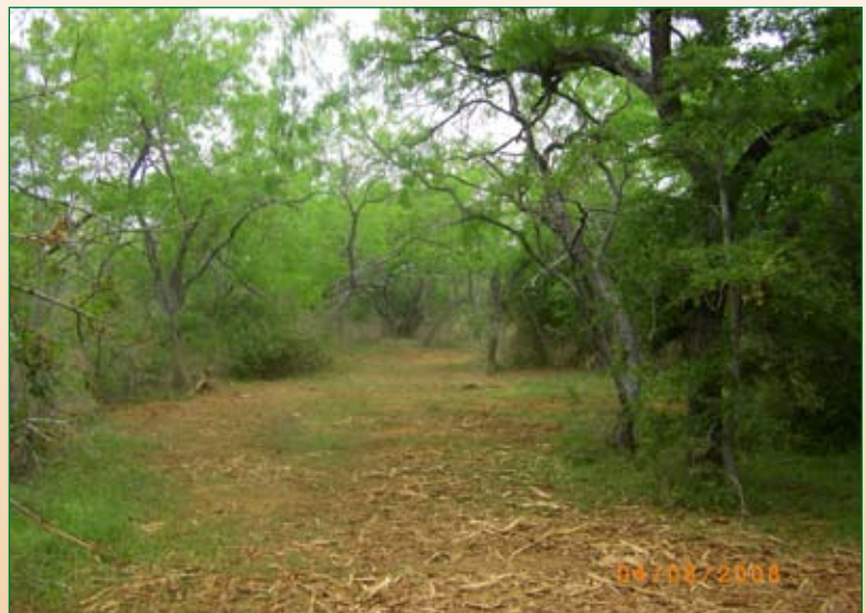
6 - Brush and small tree removal on a modest scale helped ranch sell to first contact after work was performed.