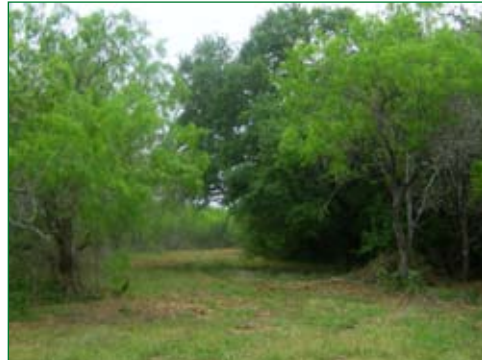
4 - Cedars on this land blocked the view of a creek.