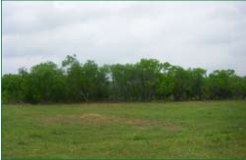
1 - Cleared mesquite and cedar leaves defined forest edge and grasses.