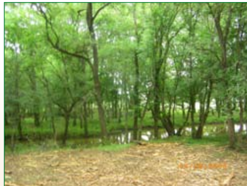
5 - Great view of creek after clearing.