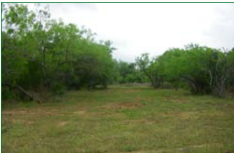
3 - New route doubles as sendero, fire break and road network.