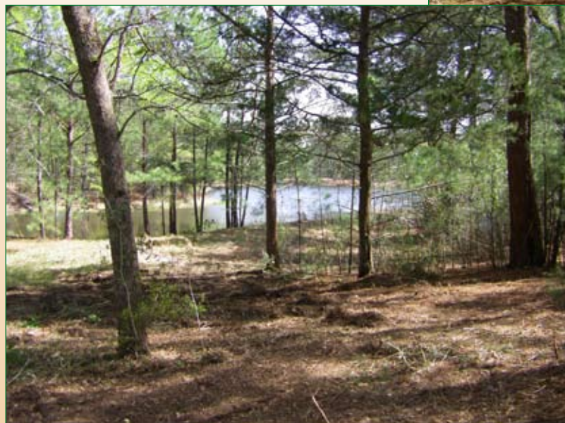
End of trail. Time for a swim!

Natural Texas 512-970-0053 www.naturaltx.com