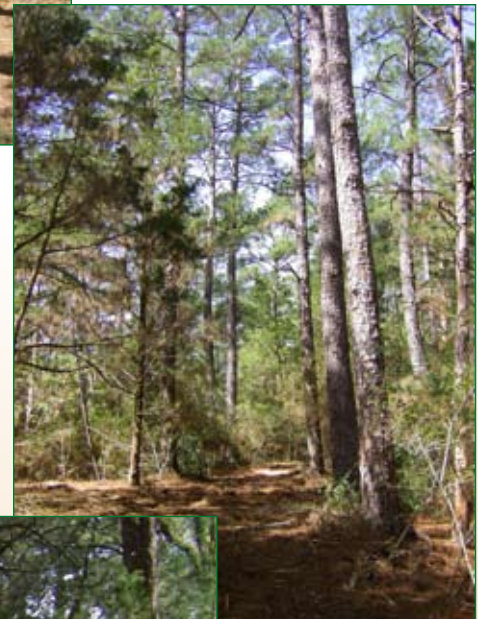
A walk in the woods on a beautiful spring morning.

Natural Texas 512-970-0053 www.naturaltx.com