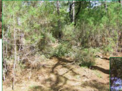
Hand clearing after initial pass with Rayco C100