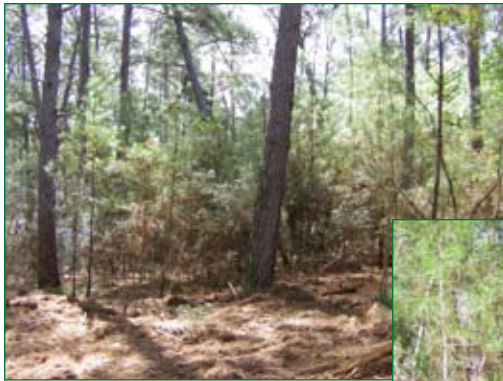
Before the trail was built