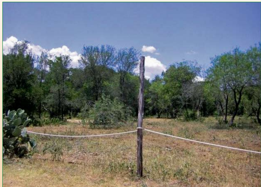
The arena is ready for dressage practice.