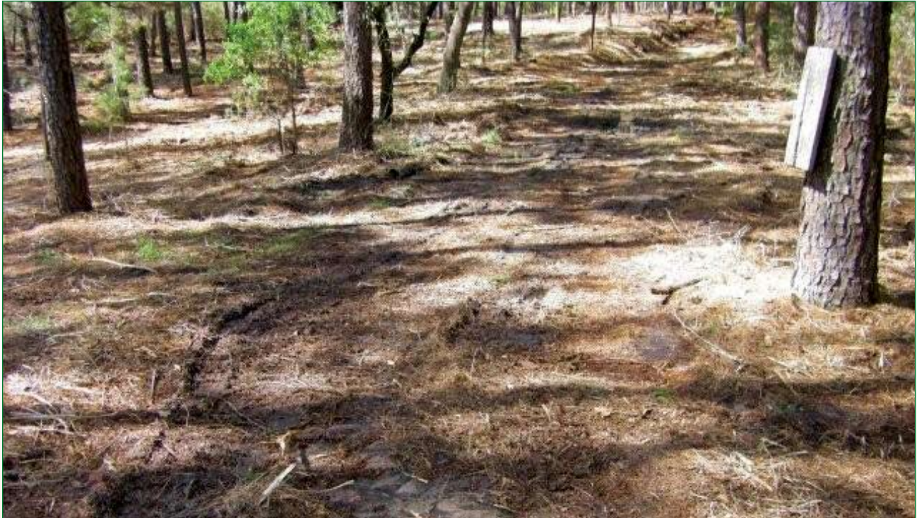
After about a dozen passes, Natural Texas' steel track hardly leaves a trace.

In the photos below taken after a 3 inch rain, you can see the minimal impact of the Natural Texas steel track compared to deep ruts left by a rubber tire skid steer.