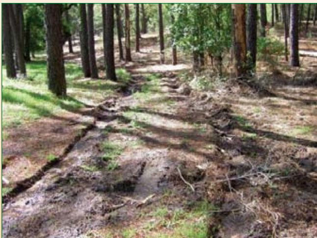
Obvious ruts left by skid steer after only 2 passes.